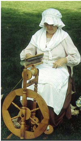
Watch demonstrations of spinning yarn.